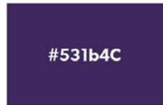
PRIMARY COLOUR 2