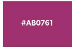
PRIMARY COLOUR 1