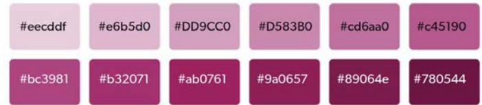
TINTS AND SHADES OF #AB0761